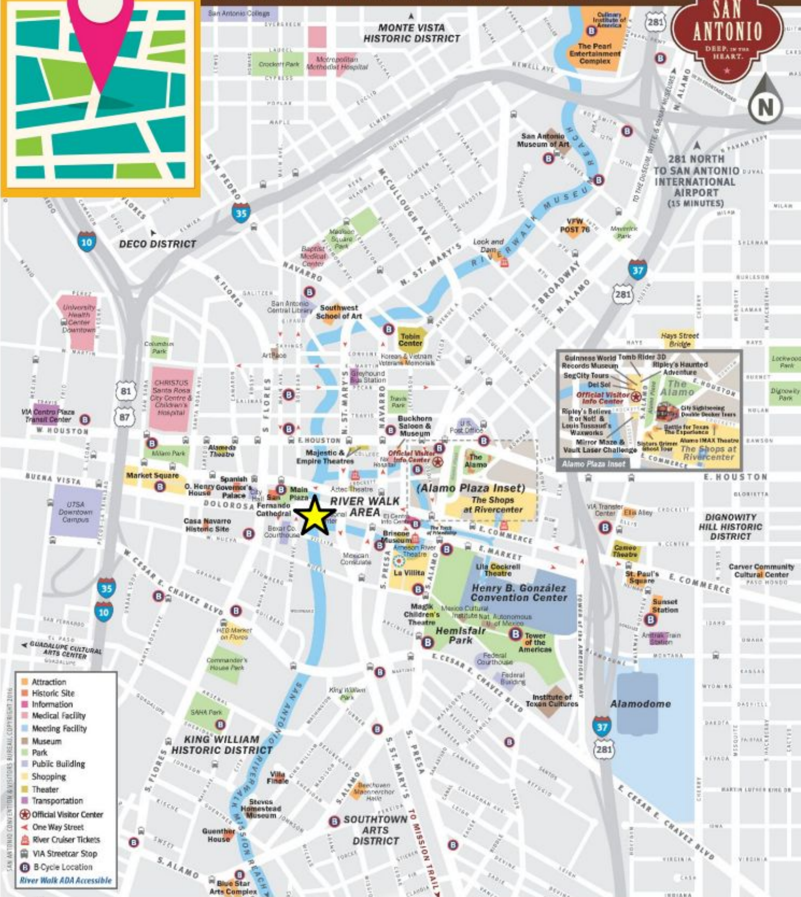
★ Drury Plaza Hotel San Antonio Riverwalk